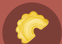
CRESTE DI GALLO CREH-stay dee GAHL-low