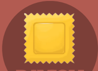
RAVIOLI with ricotta + herbs (+2)