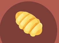
GNOCCHI with ricotta + herbs (+2)